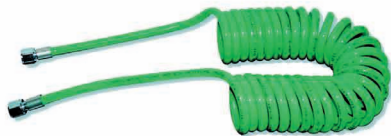
Single Spiral Hose Assemblies

Amvex Corporation is the only official manufacturer of UL listed, CE Marked and CSA Approved Medical Hose Assemblies in the world. Our bulk hose and hose assemblies are available in a variety of gases and configurations. All of our medical hose assemblies are 100% tested and quality inspected prior to leaving our facility. These hoses are also available in MRI options if required. To compliment our hose assembly line, we also carry a heavy duty Hose Retractor with a 48" high performance stainless steel cable. All of our hoses and hose assemblies are available in USA and ISO colors.