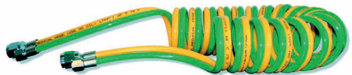
Double Spiral Hose Assembly